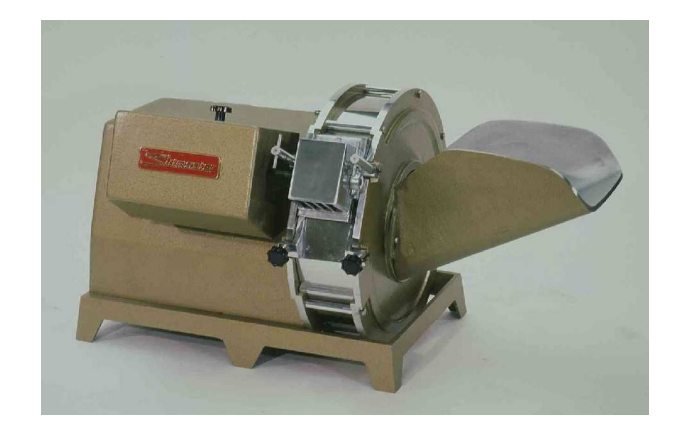
French fries slicing machine KF with circular slicing block